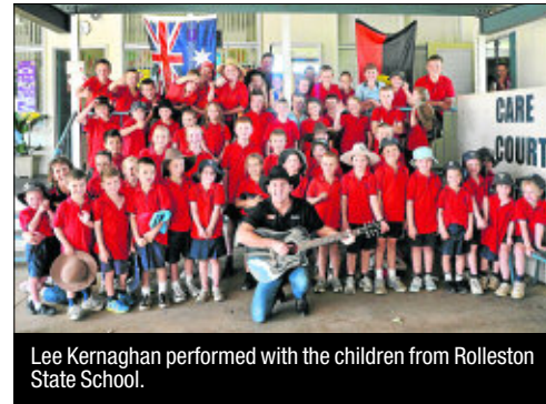
Lee Kernaghan performed with the children from Rolleston State School.