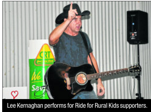
Lee Kernaghan performs for Ride for Rural Kids supporters.