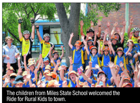
The children from Miles State School welcomed the Ride for Rural Kids to town.